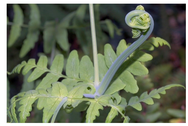
Crozier on Histiopteris incisa.