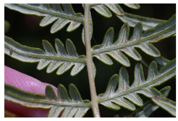
Bracken, Pteridium esculentum , showing matted hairs under the pinnae and the marginal indusium.